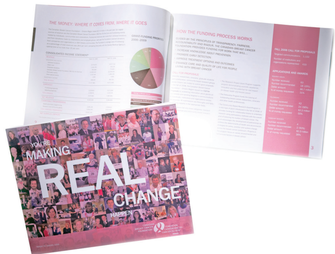
Annual Report example

LONDON ScreenWorks, Studio 2.15 22 Highbury Grove London, UK N5 2EF T: +44 (0)20 3598 2601